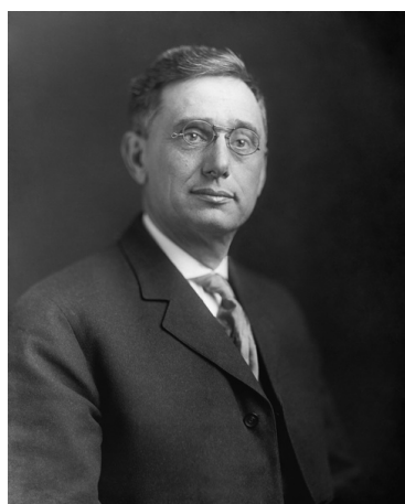
Louis Dembitz Brandeis