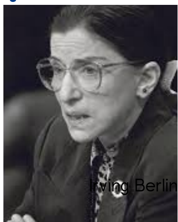
Ruth Bader Ginsburg