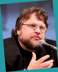
Guillermo del Toro